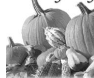
Give Thanks To The Lord Who Is Good... While Love Endures Forever! 2017