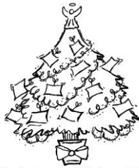
Christmas Giving Tree

Our Giving Trees with gift tags for Project Joy and the Nursing Home Residents have been set up in the Church.