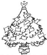
Christmas Giving Tree

Our Giving Trees are up in the Church with the tags for the Nursing Home Patients and Project Joy for the Children. Please be as generous as your means allow. If you take a tag, especially for the Nursing Home Patients, please return it. If you find that you cannot purchase their request, please return the tag to the trees so someone else might be able to provide the present for them. Presents for the Nursing Home Patients should be wrapped and the tag attached (firmly!) to the package. Toys and gift cards for Project Joy should be UNWRAPPED . Please NO clothing for the children as we don't know their size. The box for the gift card donations will be in the vestibule of the Church. Please return all gifts and cards by Sunday, December 17 th so that they may be sorted and distributed that week.