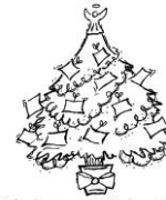
Christmas Giving Tree

VOCATION VIEWS: John the Baptizer appeared in the desert proclaiming the Lord. Who will proclaim him in this generation? (Mark 1:1-8)